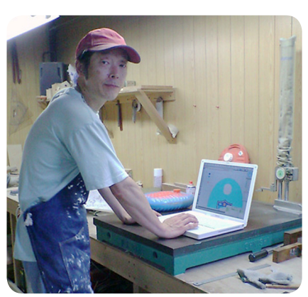
Kiyoaki-Shin-i is creating a vacuum nozzle in Cobalt 3D modelling software prior to proto-typing.