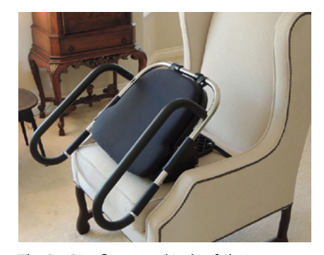
The ProRise fits many kinds of chairs. Attachable extension handles help when extra leverage is needed. Very little upper body strength is required.