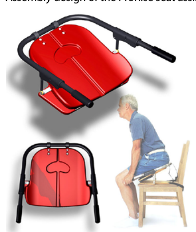
The ProRise can be used by most anyone to lower to or stand from a seated position using only the leverage of their own body weight. It's lightweight, portable and affordable.