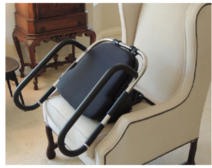
The ProRise fits many kinds of chairs. Attachable extension handles help when extra leverage is needed. Very little upper body strength is required.