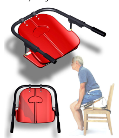
The ProRise can be used by most anyone to lower to or stand from a seated position using only the leverage of their own body weight. It's lightweight, portable and affordable.